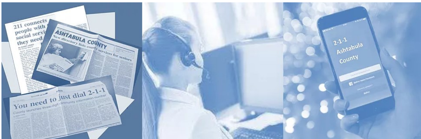
2-1-1 updates for the week of July 2nd, 2023