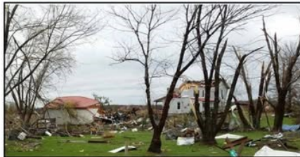
November 5, 2017, Williamsfield Tornado