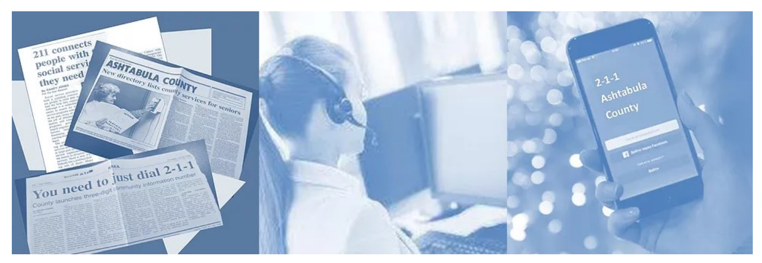
2-1-1 updates for the week of Sept. 12th, 2021